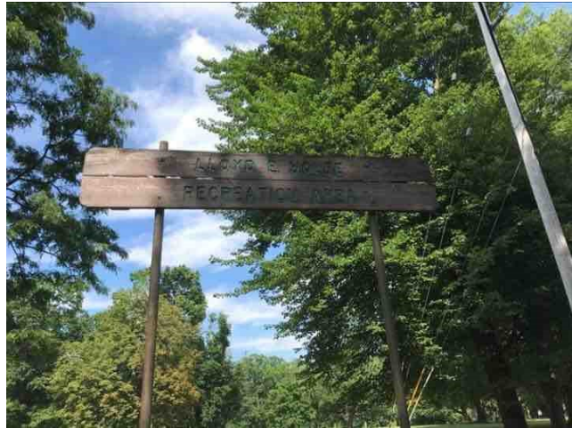
Close up of sign text